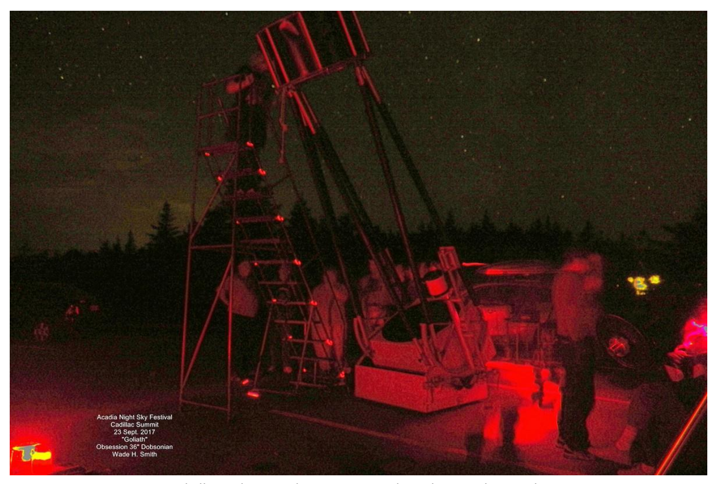
Godzilla at the Arcadia Star Party