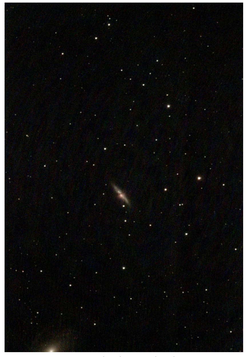
M82, Cigar Galaxy

I loved how everyone shared their discoveries and the great company. Can't wait to the next meet up. I brought my new Vaonis Vespara and took a couple stacked photos of M82 Cigar Galaxy and IC 434 Horsehead Nebula. Here's the photos