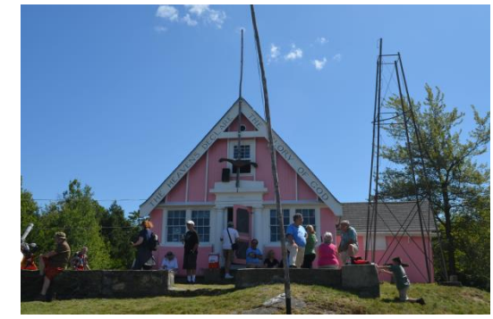
The Pink House