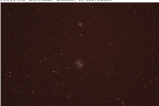
M27, the Dumbbell Nebula in Vulpecula