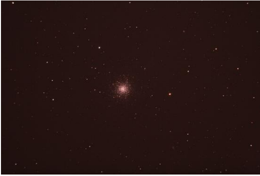
M13, the Globular Cluster in Hercules