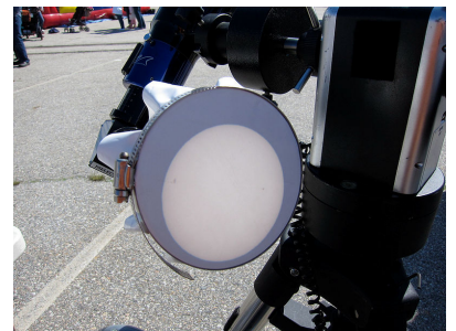
Observing sunspots by projection through a solar funnel.