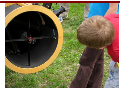
Inquisitive minds want to know how Mr. T. the 14" Newtonian reflector works.

NHAS played a major role in the McAuliffe-Shepard Discovery Center's annual AeroSpaceFest event.