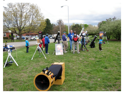
All set for solar observing... now all we need is the Sun [which did show itself eventually].

NHAS conducted an evening sky watch on Friday night and solar observing during the day on Saturday. These events were all held on the grounds outside the Discovery Center, open to the public, free of charge.