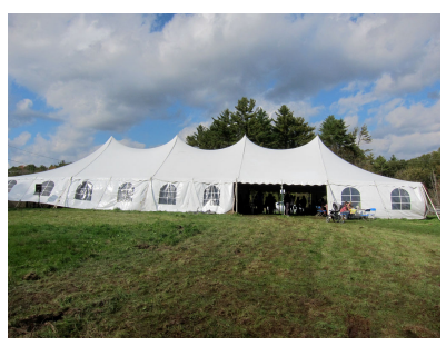
The NEFAF exhibition tent