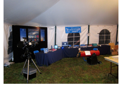
NHAS's indoor display at NEFAF