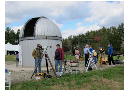
Solar observing at NEFAF