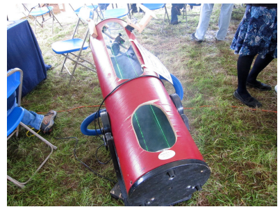
"Smokey Joe" illustrates the principles of a Newtonian reflector