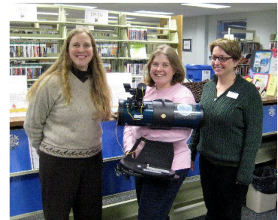
The librarians of Wigin Library, Stratham, and their new lending scope.