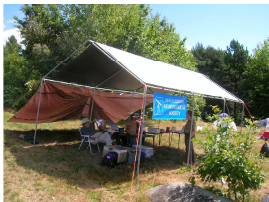
The NHAS tent

It was a great weekend at Stellafane. The weather a bit cooler than we had during the week and also much drier.