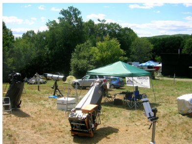
View South from the NHAS tent, showing some members' scopes

It was a great weekend at Stellafane. The weather a bit cooler than we had during the week and also much drier.