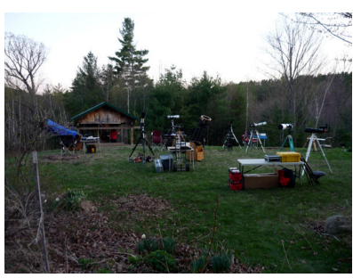
MM 2010 observing field.

This was my first attendance of the MM. There always seems to be something in March that conflicts with that Friday. I didn't keep a rigorous tally but I saw something like 20 or so. Lots of good food and conversation. Truly a fun event!