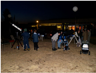
The observing field