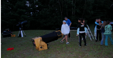
Getting ready to observe through Mr. T.