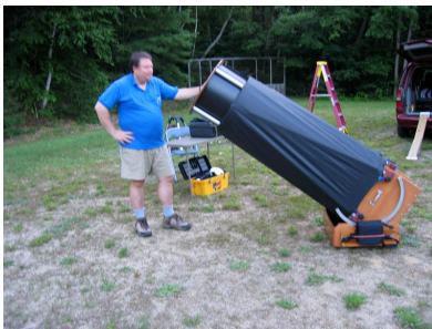
Getting Obby ready for action