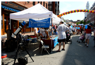
Our booth, early in the day.

More Market Square Day images by Gardner Gerry: