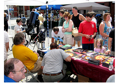
The NHAS boot setup from the inside looking out.

Market Square Day images by Tom Cocchiaro: