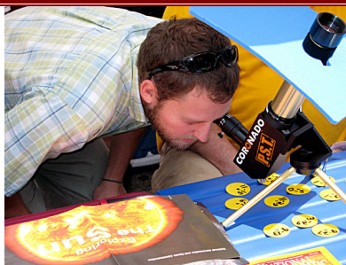
Solar observing in H-alpha.