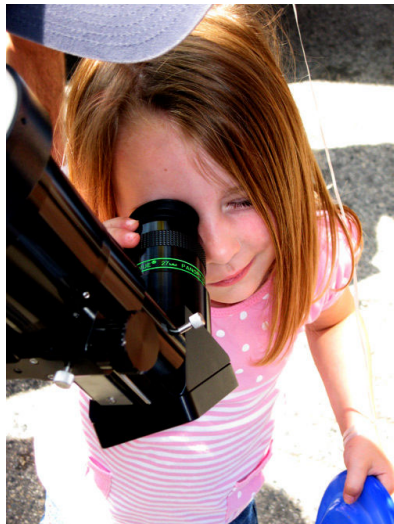
Viewing the Sun through Gardner's scope.