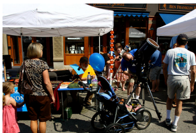
We had solar scopes set up and lots of goodies to give away.