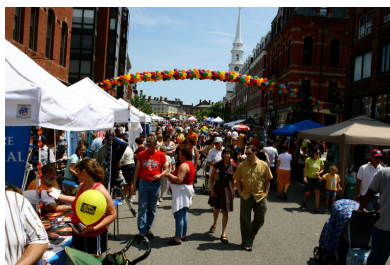
By midday, we had non-stop action due to the crowds.