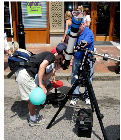
A passerby gets a TeleVue of the Sun through Gardner's scope.