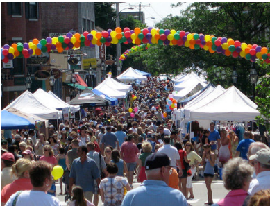
A view of the crowd moving along Congress Street, where the NHAS booth was positioned.

Our appearance at Market Square Day was an unqualified success. We handed out nearly all of the 250 brochures printed and almost 150lbs worth of goodies including most of our care package from NASA's SOHO program.