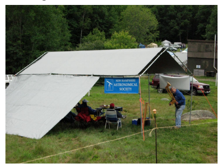
The NHAS tent

Weather was astonishing. No tents floated away. No bugs bit Larry. Gardner did not have as much luck. We apparently were a wasp magnet. And a car magnet.