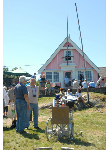
The Stellafane permanent building

Many, many people provided all sorts of things just in time, such as Gardner.