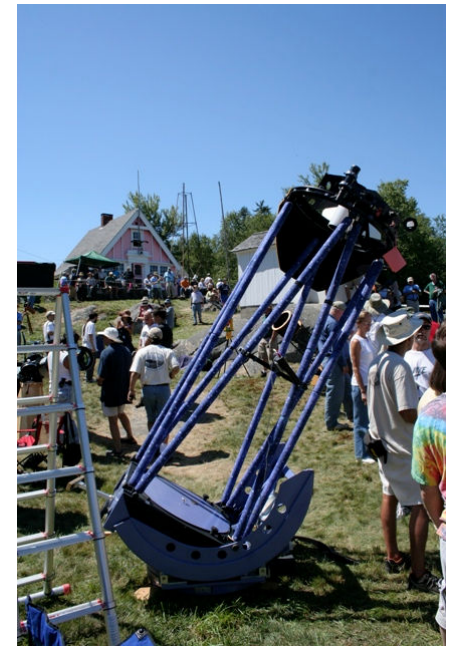
Allan Rahill's 28" dob