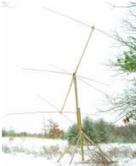
Antenna by Bob Sletten Hi Radio Astronomers,

Big picture wise, the radio astronomy stuff still is finding its footing while leveraging opportunities as they present themselves. One such opportunity involves a relatively easy project next month in conjunction with the Leonid's Meteor shower. In a nutshell, the idea is to try and hear low frequency radiation from meteors, as there is some evidence that meteors make very low frequency (VLF) electromagnetic radiation (See references below). The current issue of S&T magazine proposed an opportunity given the timing of the Leonids to test that theory. The date of the shower is November 18 –19. The predicted peak is 11:45 PM that Saturday night.