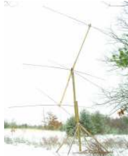
Antenna by Bob Sletten

As everyone knows, we have had some great radio Astronomy dish tours with very positive feedback. The simple message has been, "give us more!" With that in mind, I am trying to set up another radio tour for us to see more big dishes. There is one in our own backyard here in NH that I am targeting and it is located at a satellite tracking station. The date and time will be announced when I can lock a date and time with the site. In September, we will have a non-tour meeting to talk about what the group might actually desire to work on. Several members have inquired about building a radio telescope with some equipment already donated. Remember to please visit the Radio Astronomy forum on the website for any discussions in this area or contact me for any questions.