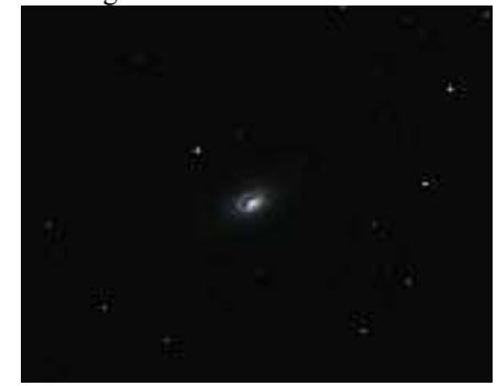
M64 * Blogs extracted by Rich DeMidio