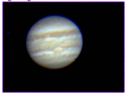
Using a ToUCam Pro II webcam and about 1000 frames in positively horrible seeing conditions, I was optimistic and trying to see if we could grab the new Red-Spot-Jr. No luck, but we did see its daddy. Hopefully conditions will improve

It stopped raining!! Huzzah! Jupiter has been calling for quite some time, and now that it is past opposition, the weather finally cleared up enough last night to grab a few frames.