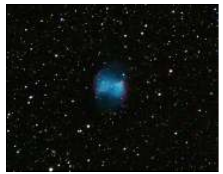
Dumbell Nebula I need to revisit this one and get some longer exposures to pick up the spiral structure around the core but here's what I got so far.