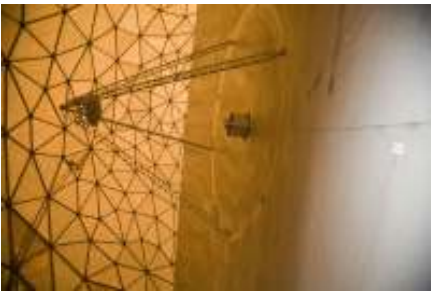
The sub-reflector and dish frontsurface.