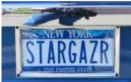
This New York license plate says it all.

I recorded audio at most all the sessions. If anyone is interested in getting a CD copy of the presentations in mp3 or .wav format, and some