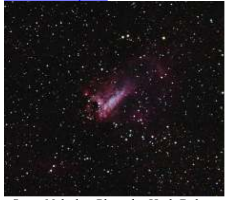
Swan Nebula - Photo by Herb Bubert

http://community.webshots.com/album/230997590tTyFLv