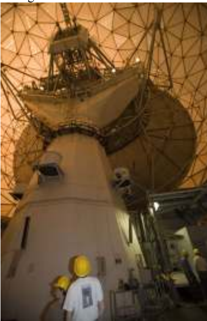
The view of the telescope from within the dome.

Before the tour, Phil provided a briefing to the attendees regarding the configurations.