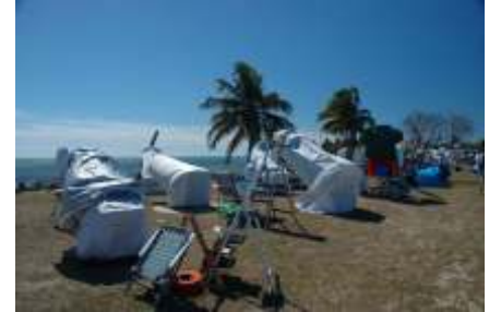
Winter Star Party