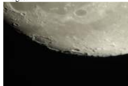
Photo taken by Rich DeMidio using Nils PowerMate and Stiletto focuser.

taking off the focal reducer to make it an f10. This picture is 24 stacked images.