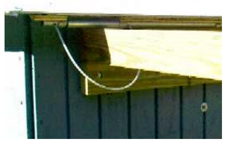
is controlled by a dimmer, It provides illumination for setup.

In the center of the hexagon is a pier described in the October NHAS newsletter. The red line seen around the interior is a Christmas rope light that